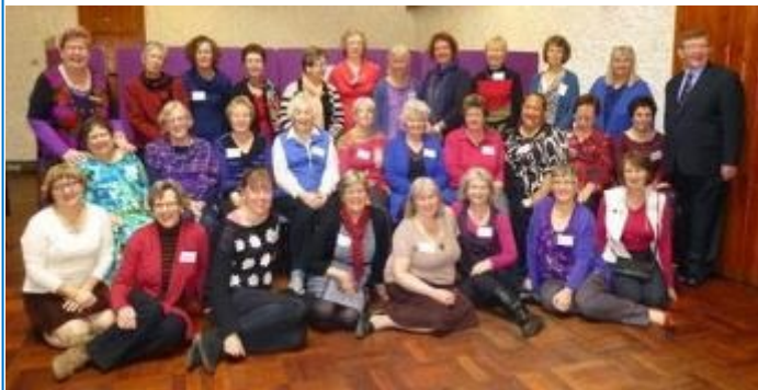
Group photo from conference in Wellington