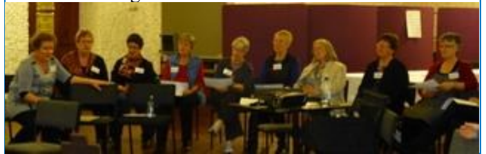
During a conference interactive session